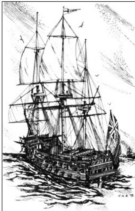
God bless them and all who sail in them